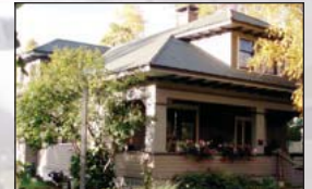
Alaska Heritage House www.alaskaheritagehouse.com