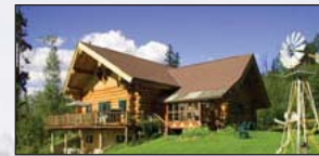
A Moose in the Garden www.amooseinthegarden.com

Summer is the height of tourist season in Alaska and hotel rooms anywhere in the state can be scarce. Rely on Alaska Aerofuel's thirty-year relationship with local establishments to help you find the ideal accommodations for a summer crew swap. Alaska Aerofuel has secured numerous hotel rooms for the entire month of August to ensure your crews are rested and ready for your Olympic flights.