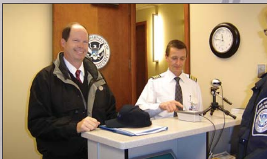
Customs & Immigration professionally and courteously process crews and paxs in the Alaska Aerofuel FBO

le route airport catering to corporate aviation. Alaska Aerofuel offers experienced staff, first-rate services and equipment, and the only on-site Customs and Immigration office in an Alaskan FBO.