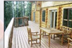
Grandview Bed & Breakfast www.grandview-bb.com