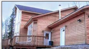
Ridgeview Bed & Breakfast www.ridgeviewbedandbreakfast.com

There is no denying that Interior Alaska is different than the rest of the state. The chance to explore these fascinating differences has lured countless visitors to the area and now crews are discovering that Fairbanks is a great place to do their swap.